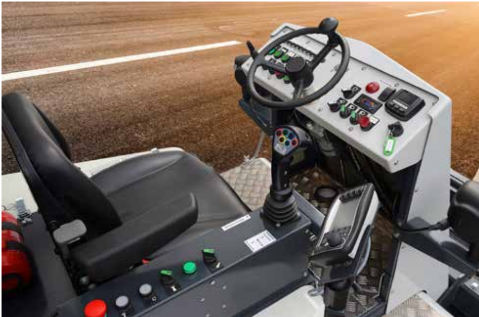
Left: The computer-aided dosing control with LCD control unit to the right of the driver's place is an optional extra for the precise control of the binder application rate ( \text{kg}/\text{m}^2 ), independent of driving speed and working width.