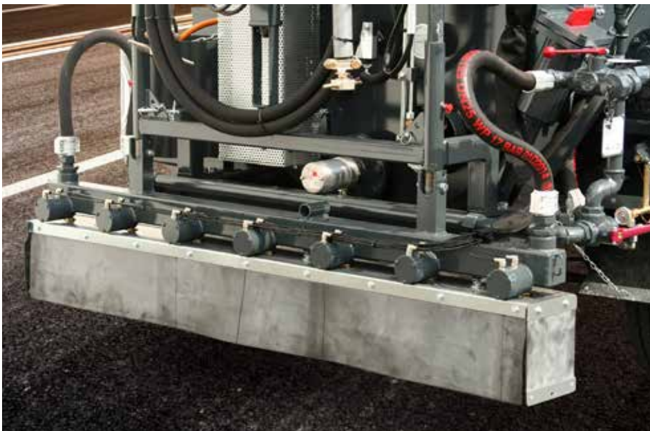
Left: Spray bar with electro-pneumatic individual nozzle switching.