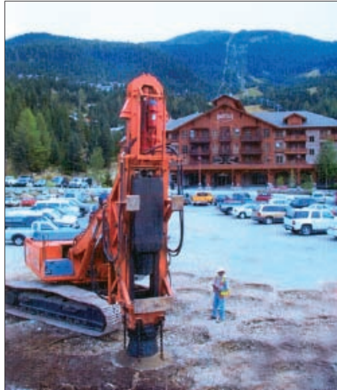
RIC 7000 compacting loose fill material for car park development