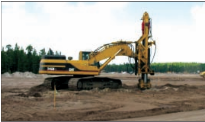
RIC 7000 preparing foundations for school

The building footprint of 120,000 square feet included footings designed for 2,500 psf bearing pressure and column loads up to 720 kips with typical column loads less than 200 kips.